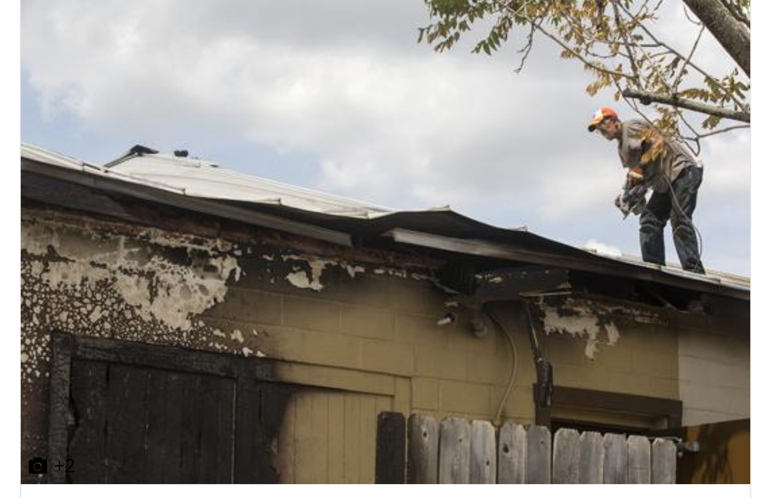
Friesenhaus owner plans for restaurant's future