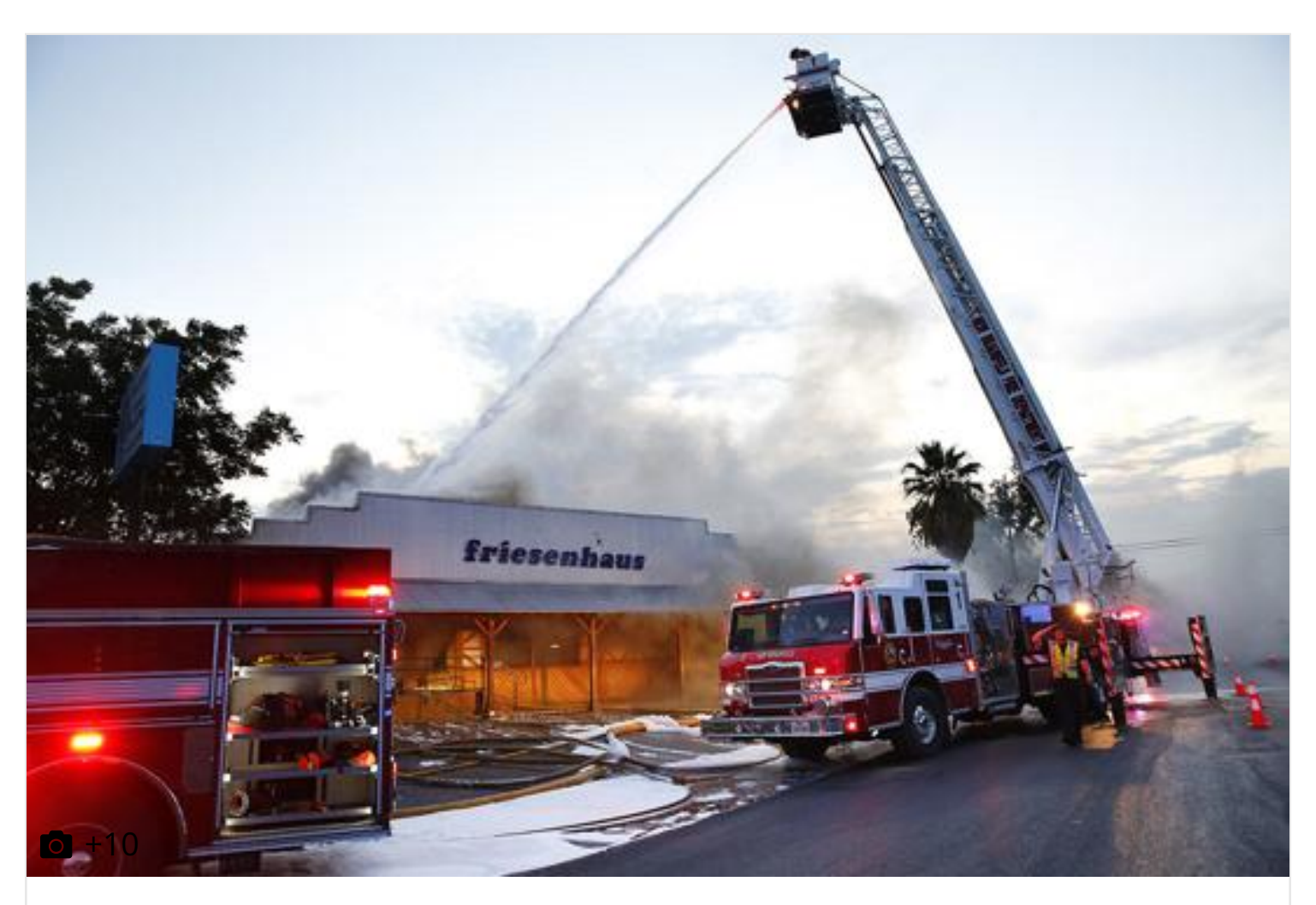
NBFD battles Friesenhaus blaze